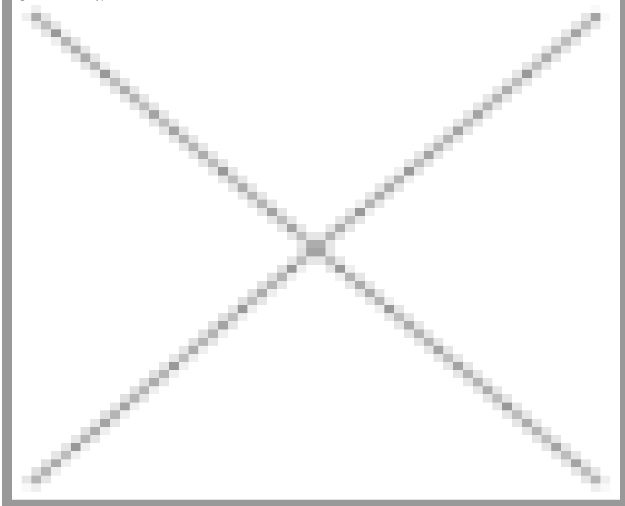
Figure 5: Actual trajectory of a process (black dotted line), expected trajectory (green line), predicted “open loop” future performance of the rest of the process (dark blue dotted line) and predicted “closed loop” future performance following a process intervention as suggested by Control Advisor (light blue dotted line).

Visit www.umetrics.com to download a 30 day free trial of SIMCA-online and use Control Advisor.